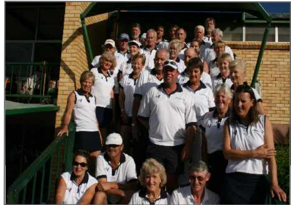
Some of the Vics before play began

A most enjoyable event played over two days with 16 selected men and women from VIC, SA & NSW competing for the above trophies.